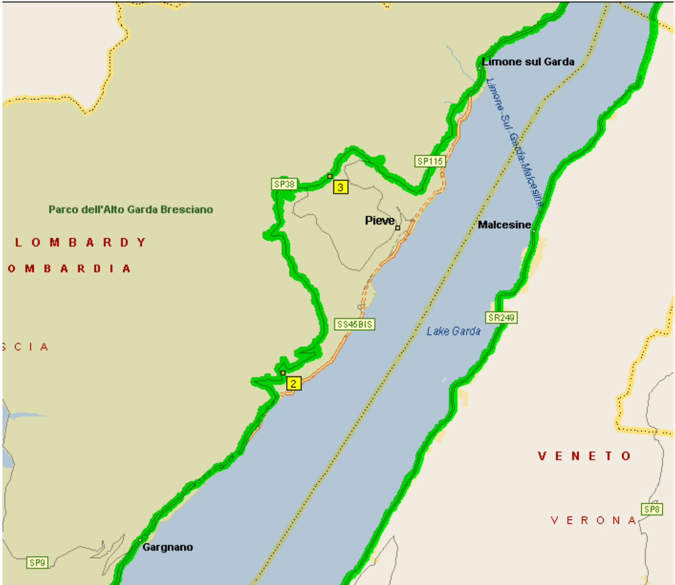
To Tremosine and Tignale